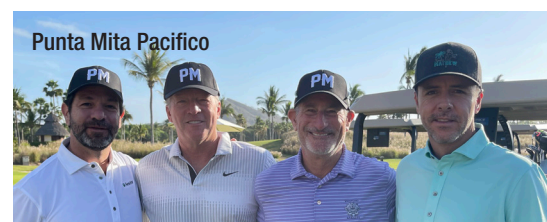
Punta Mita Pacifico