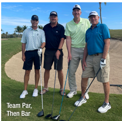
Team Par, Then Bar