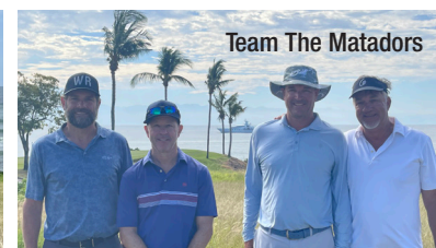
Team The Matadors