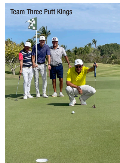
Team Three Putt Kings