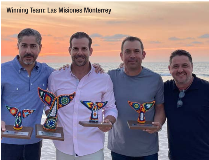
Winning Team: Las Misiones Monterrey

The 2023 Punta Mita Pro-Am will take place on Wednesday, March 29th – Sunday, April 2nd.