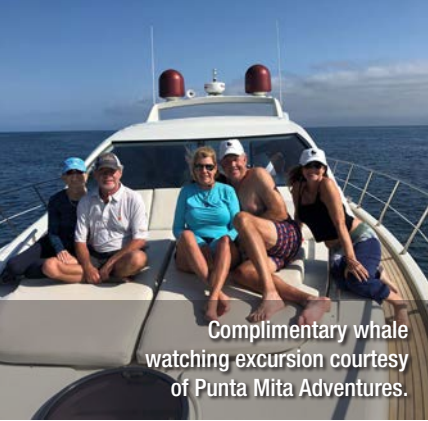
Complimentary whale watching excursion courtesy of Punta Mita Adventures.

capability. Enjoy the tournament and don’t let an errant shot weigh you down,” advised Jack Nicklaus. After a practice round on the Pacifico Course, twelve teams joined the $100 buy-in to compete in an always fun, four-hole Horse Race Shootout with an open beverage cart and soft rock music playing in the background. Eight teams competed in the sudden death chip-off on the first hole to advance. On the second hole, pars were safe from elimination. At the conclusion of the third hole, team Krugman/Mizier was $250 richer. The final hole ended on the famous “Tail of the Whale” par-3. After the remaining two teams hit it greenside, a