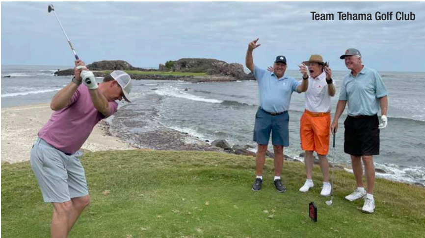
Team Tehama Golf Club