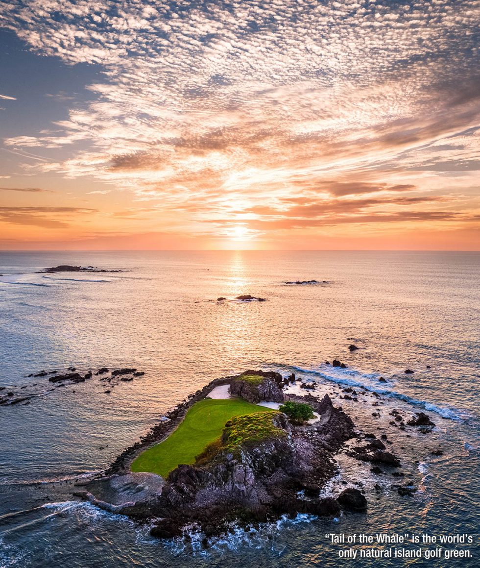
"Tail of the Whale" is the world's only natural island golf green.