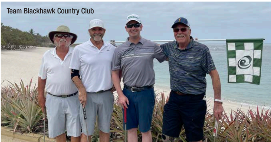
Team Blackhawk Country Club