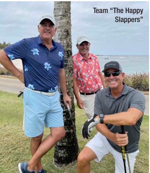
Team “The Happy Slappers”