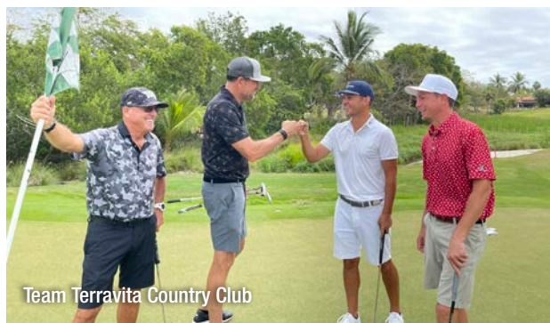
Team Terravita Country Club