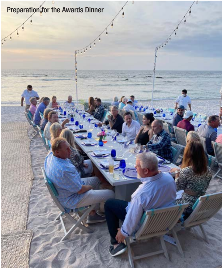
Preparation for the Awards Dinner