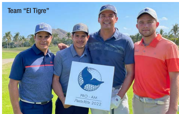
Team "El Tigre"