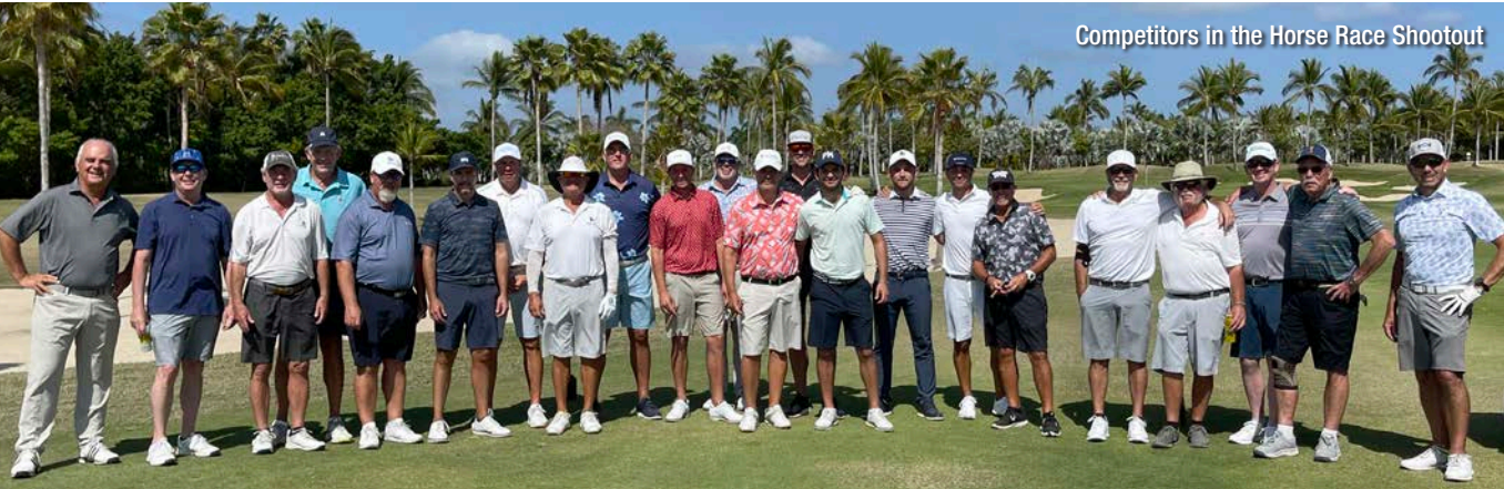
Competitors in the Horse Race Shootout