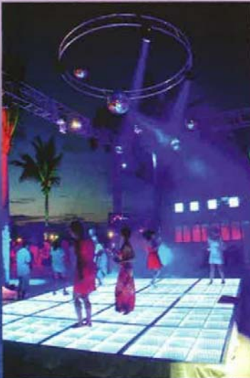
The event includes a vibrant nightlife component.

The Punta Mita Gourmet & Golf Classic has evolved into one of the world's premier wine and food events. It is a great four-day party, and you don't have to be a golfer to enjoy it to the fullest. If you are interested in attending next year's festivities go to www.puntamitagourmetgolf.com for more information. ■■